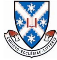
St Andrew's College